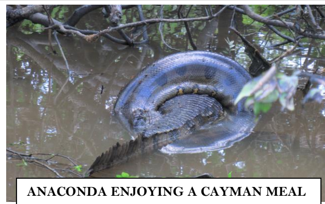
ANACONDA ENJOYING A CAYMAN MEAL