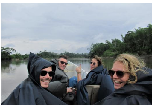
MOTORIZED CANOE NAVIGATION

You must bring your original Passport, Long-sleeved T-shirts, T-shirts, Cotton socks, Towel, Shorts, Sandals or walking shoes, Light waterproof wind-breaker, First aid kit, Swimming suit and towel, Hat or cap, Sunglasses with a strap, One small waterproof daypack, biodegradable soap for camping only, Insect repellent, Sun block and Sunburn lotion, Zip lock plastic bags, Camera and spare camera batteries, Flashlight (torch) with spare batteries, Binoculars, Notepad/pen.