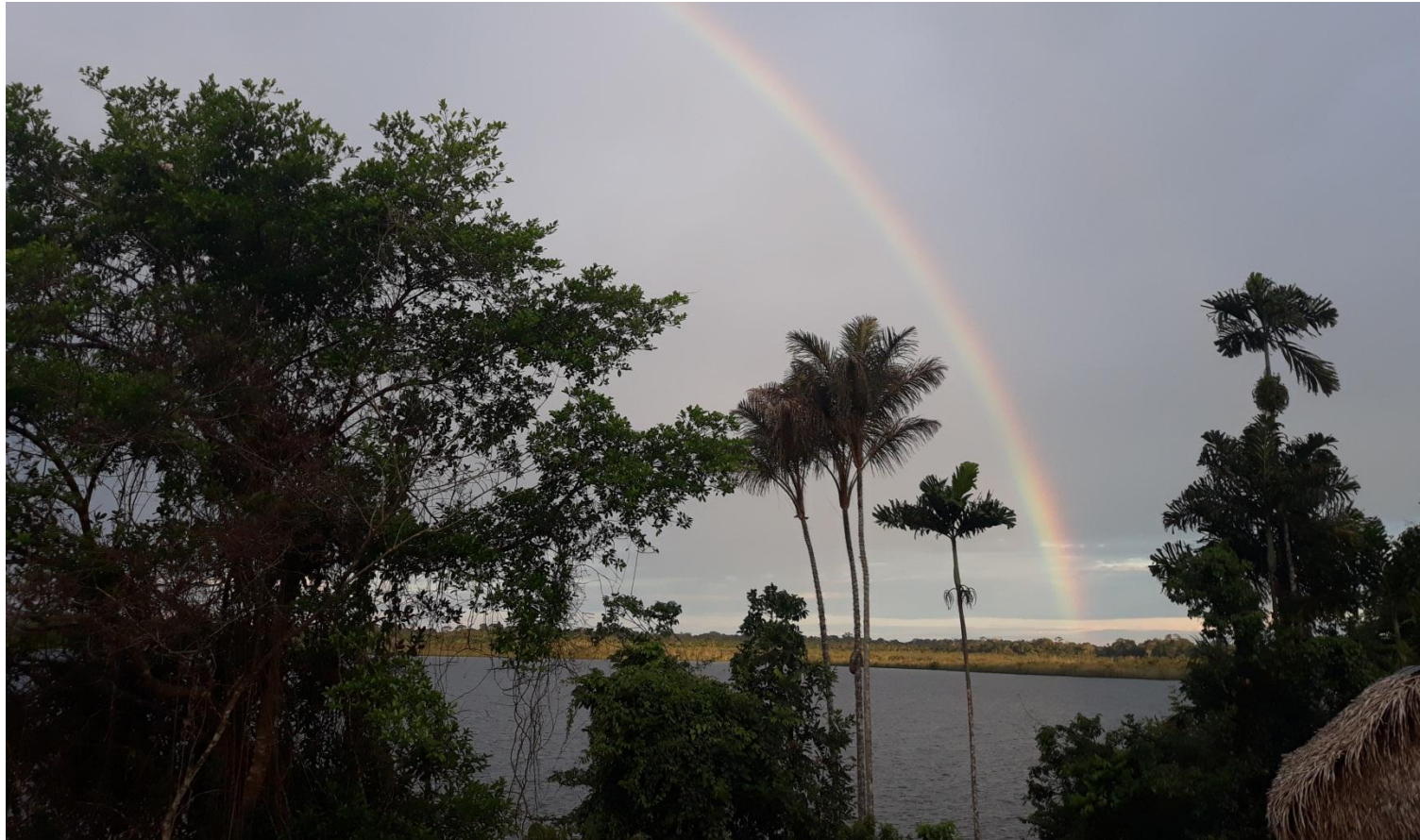
ZANCUDO LAGOON (IRIPARI)