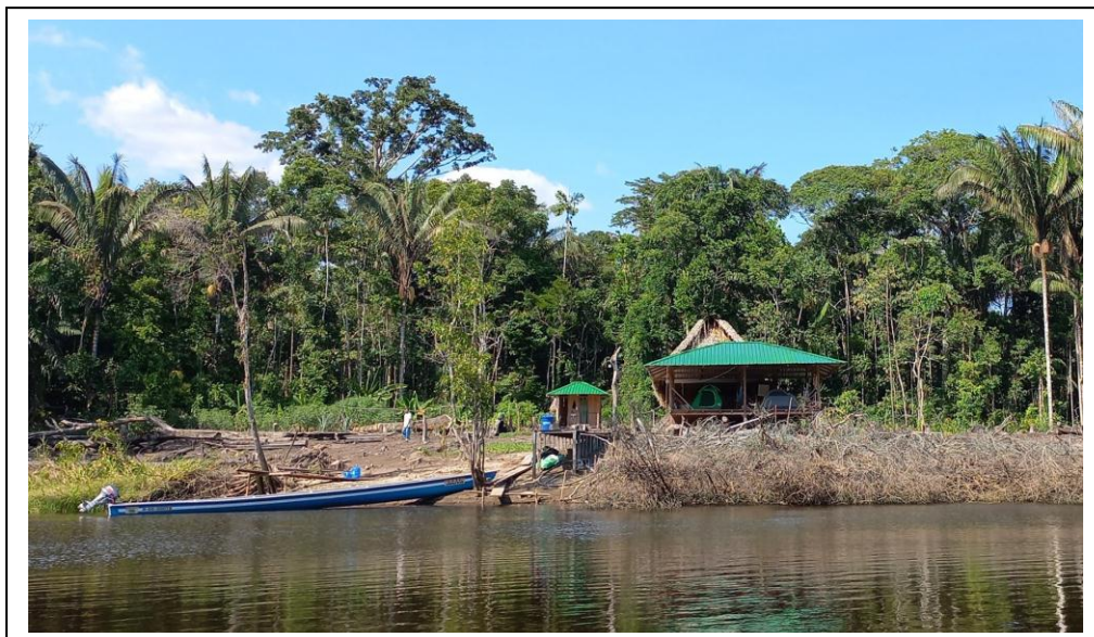
LAGARTO COCHA RIVER CAMPSITE EQUIPPED WITH A SHOWER AND TOILET